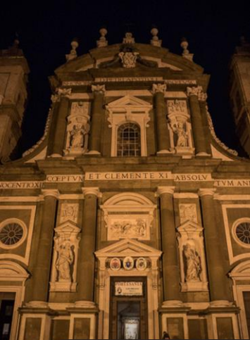
IMG_0222 by Eupeodes