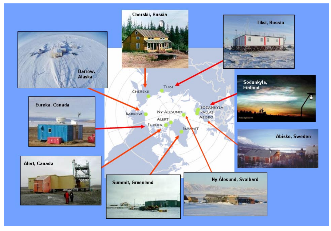
Figure 1 Map and pictures of IASOA stations

In the short time we had, we focused our discussions on sites that are sophisticated, well-maintained, manned year round, and have received significant amounts of funding from govern-