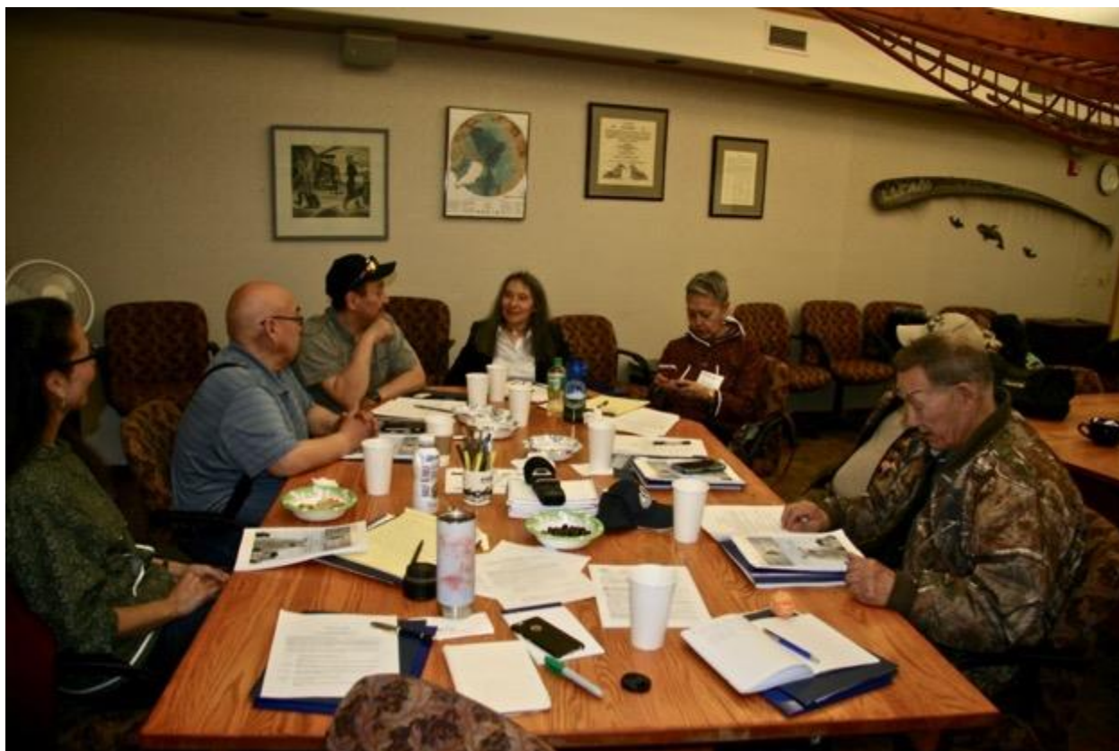
Members of the FSSG Advisory Committee meet the day before the Focus Group Meeting – Inuit Past and Current Managers of Marine Resources.