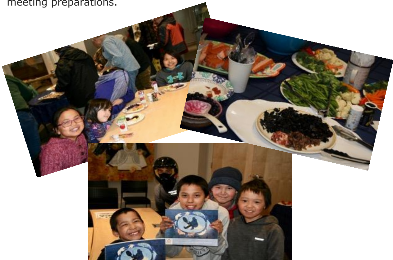
Photos taken at the Potluck hosted by the Katirvik Cultural Center.